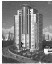
3333 Allen Parkway